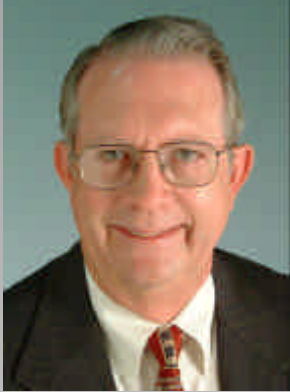
BY WILLIAM SLUHAN